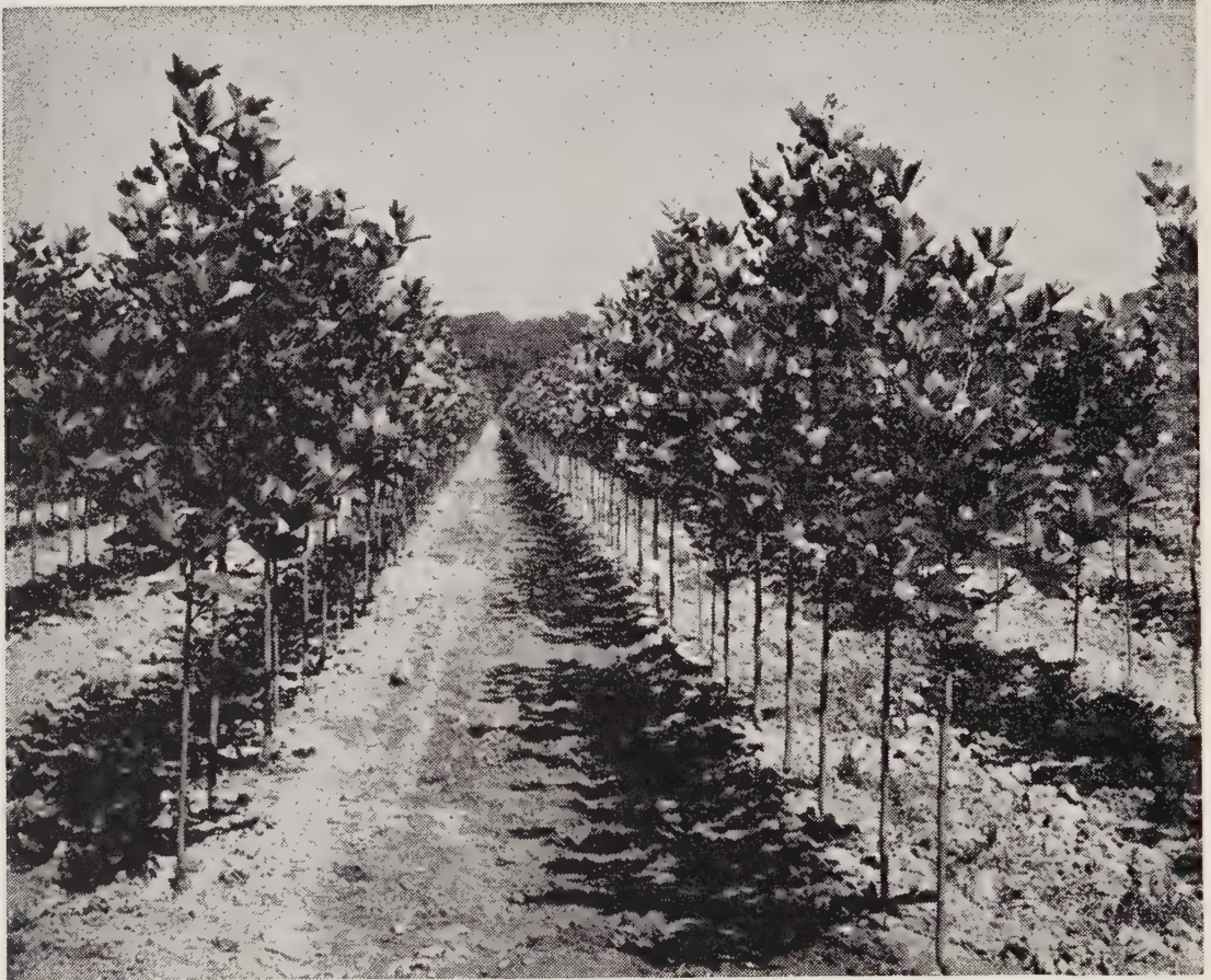
Cole's justly famous strain of London Planes. Disease-free and vigorous.